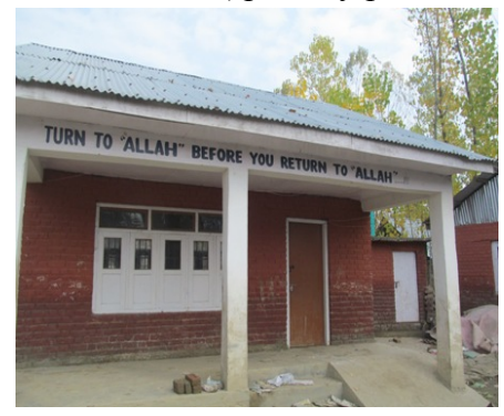
"Turn to Allah before you return to Allah"

by SPT) pencil etc. to 200 children in Shamsipora, Anantnag dist. of South Kashmir. Round 2: distributed foodkit worth Rs 1500+/ to 50 identified family in Srinagar on Gandhi Jayanti day and 50 in Shamsipora,