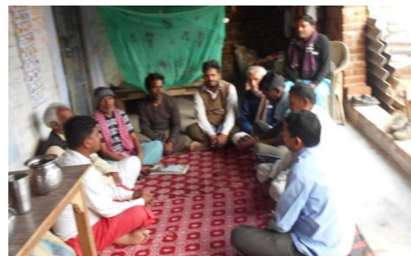
Day begins with all religion prayer