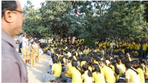
Held a couple of students' Rallies