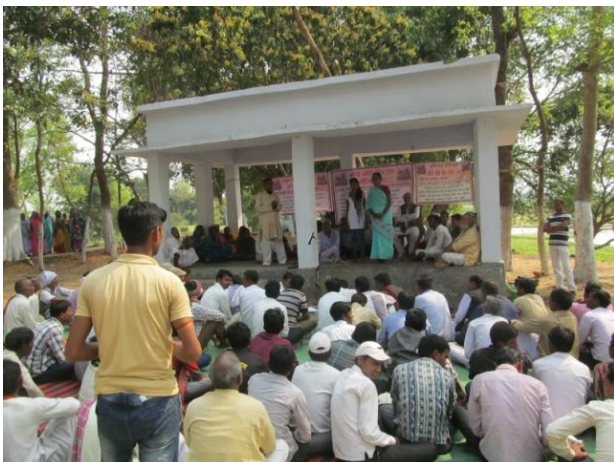
Conclusion of Nonviolence Dialogue Journey in Dist H Q Banka, 28 Feb 2015.

This strengthens Swaraj Peeth's confidence in people's acceptability of Gandhian methods of nonviolence and Satyagraha, public education and training in nonviolence which makes them capable of dealing through peaceful and nonviolent means the issues of that weaken them.