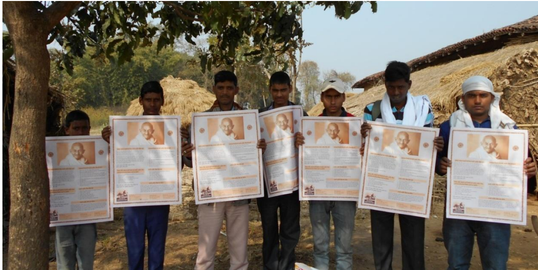
Carrying Gandhi Shanti Mitra Posters: Why a community Gandhi peace keeper/builder, their Tasks, How to become one.