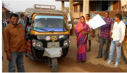
A Lady supporter flagging off onward march

The issues discussed during the Campaign included unity